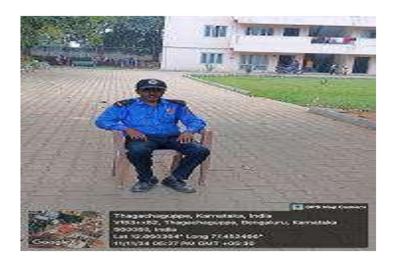
Security guard at Ladies hostel