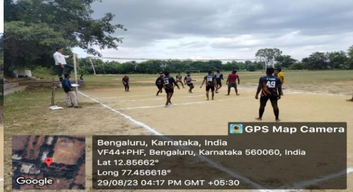
Bengaluru, Karnataka, India VF44+PHF, Bengaluru, Karnataka 560060, India Lat 12.85662° Long 77.456618° 29/08/23 04:17 PM GMT +05:30