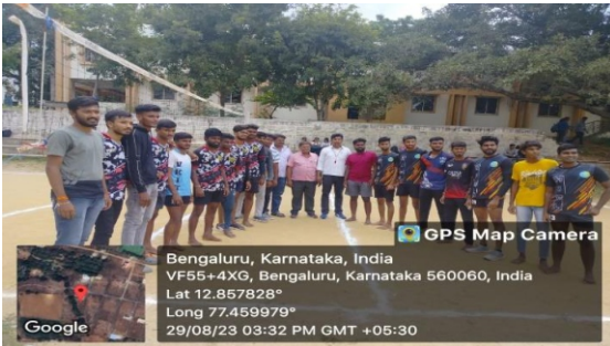
Bengaluru, Karnataka, India VF55+4XG, Bengaluru, Karnataka 560060, India Lat 12.857828° Long 77.459979° 29/08/23 03:32 PM GMT +05:30