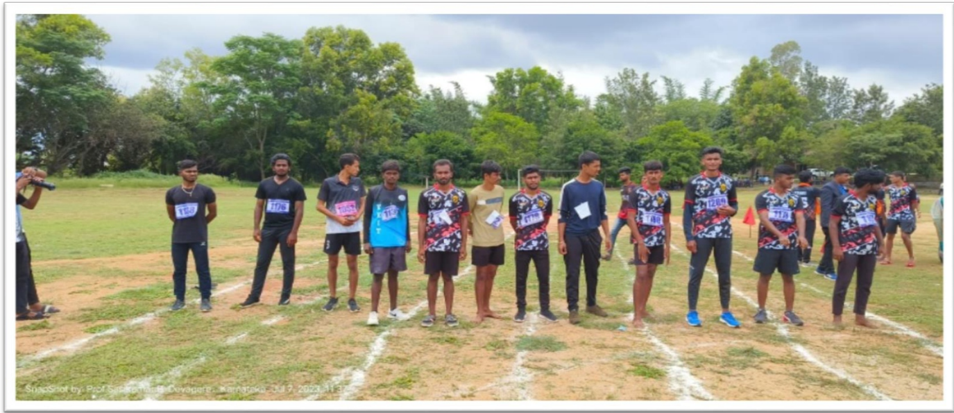
Karnataka - Jul 7, 2023 - 11:33