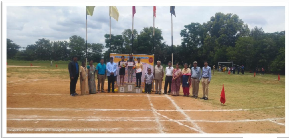
Karnataka - Jul 7, 2023 - 12:15